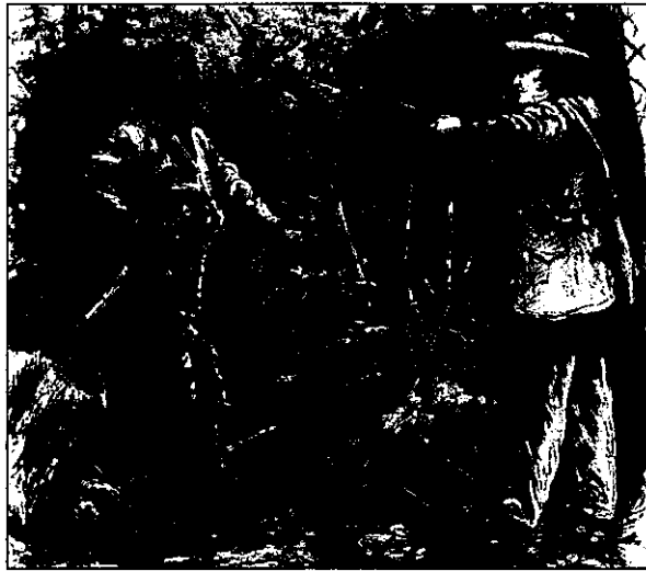
An illustration depicts the capture of Nat Turner, after he organized a Virginia slave rebellion in 1831, which resulted in more fatalities than any other rebellion before the Civil War

In fact, the thesis formulated by Arendt can even be inverted. In the classical age of liberalism, we see not only the flourishing of slavery, but the flourishing of a slavery characterized by the complete and unprecedented dehumanization of the slave. With the triumph of the market, the slave became chattel; the family of the slave was nonexistent; every individual member of this family could be bought and sold. The triumph of the market was the triumph of chattel slavery. With the flourishing of liberalism and secularism, the crown was no longer able to impose respect for the slave family or other limitations on the slave owner in the name of religion; the interferences of the political power over property disappeared completely. The property owner could dispose freely of his property, including his slaves, without restriction. At the same time, with the advent of representative bodies and self-government, we see the passing of ever stricter laws prohibiting interracial sexual and marital relations, making them a crime. We see the